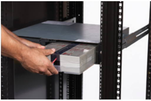
Hot-swappable internal batteries in only 2U