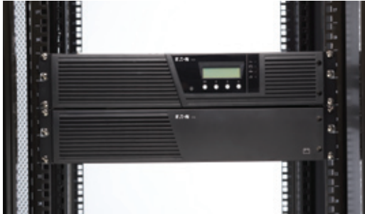
Add up to four EBMs for hours of runtime