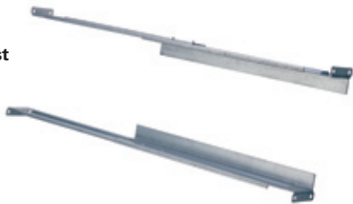
Four-post rail kit included (two-post rail kit optional)