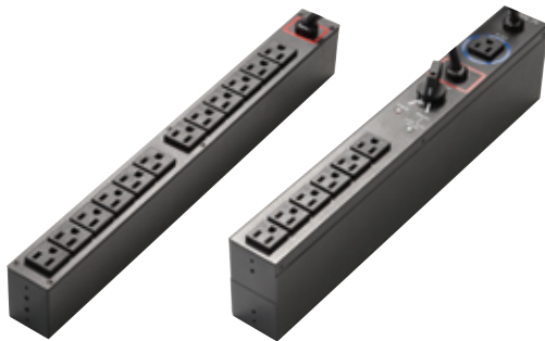
Optional FlexPDU and HotSwap MBP for greater flexibility and uptime