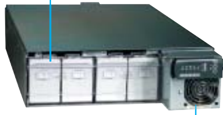
Powerware 5000/6000 VA rackmount model

Hot-swappable electronic modules - replace electronics modules without shutting down connected equipment (available on 2400 VA to 6000 VA models)