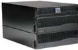
Powerware 9125 6000 VA