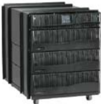
Powerware 9125 6000 VA with 2 EBMs

users to manage scheduled shut-downs and sequential startups of protected loads. During a power outage, users can shut down power to non-critical devices, thereby extending battery backup time available for critical devices. When the load segments feature is used with Powerware