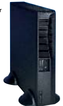
Powerware 9125 3000 VA